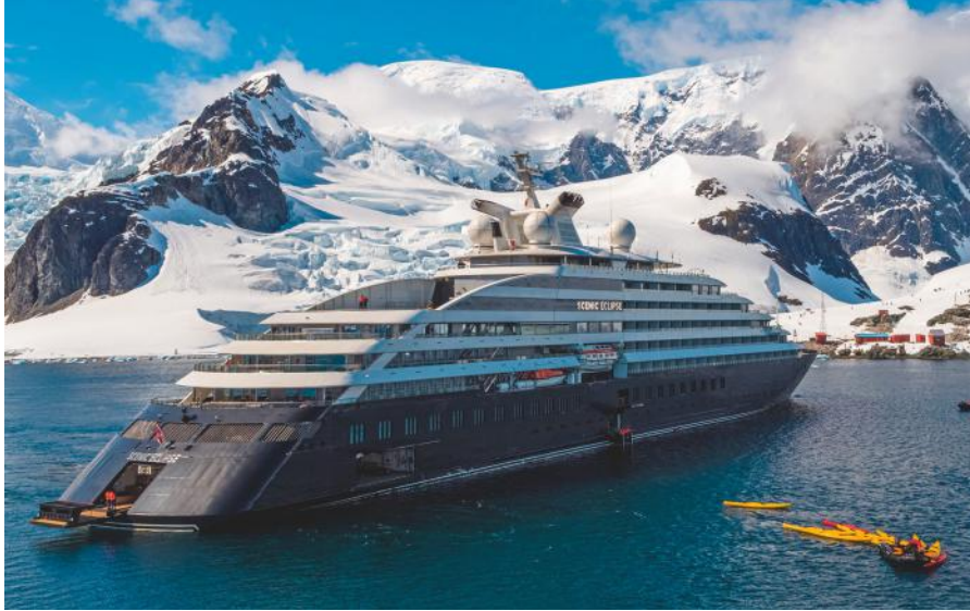
CLOCKWISE FROM LEFT: Scenic's Scenic Eclipse in Antarctica; northern lights in Alta, Norway; Viva Cruises' Viva Enjoy