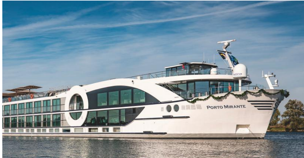
CLOCKWISE FROM LEFT: Riviera Travel's Porto Mirante; Seabourn's Seabourn Pursuit in Kimberley, Australia; Athens; A-Rosa River Cruises' A-Rosa Alea