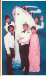
The Love Boat (inset); romance on board

Whether your clients are die-hard Eurovision enthusiasts or simply seeking some Europop fun, Royal Caribbean Cruise Line has joined forces with the annual music competition to bring Eurovision's party atmosphere to four sailings in Europe this May. Guests will be treated to the ultimate Eurovision Song Contest viewing experience, with curated menus, themed cocktails and – naturally – singing competitions. Rates from £329 per person. royalcaribbean.com