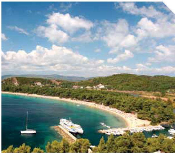
LEFT: Koukounariés beach