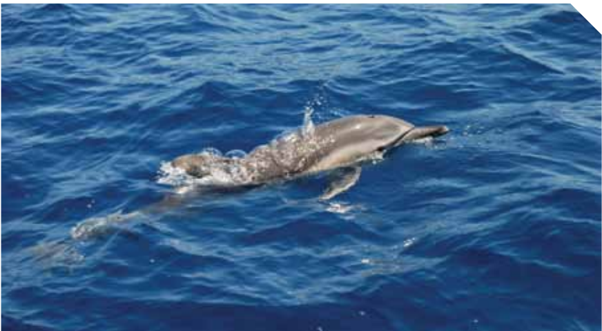
ABOVE: National Marine Park of Alonissos

→ A trip to Skopelos Town also makes for a lovely evening, where I saunter through flagstone streets, past slate-roofed houses with wooden balconies, and stop off for a glass of ouzo en route.