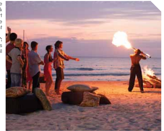
RIGHT: Beaches Negril

→ Spa. She says: "The hotel has a very comprehensive all-inclusive package, which includes meals at up to five restaurants, afternoon tea, alcoholic and non-alcoholic beverages, one green fee per stay, a spa treatment, non-motorised water sports, and a free baby, kids' and teens' club.