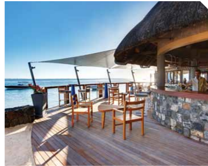
LEFT: Heritage Awali Golf & Spa Resort Infinity Blue Restaurant