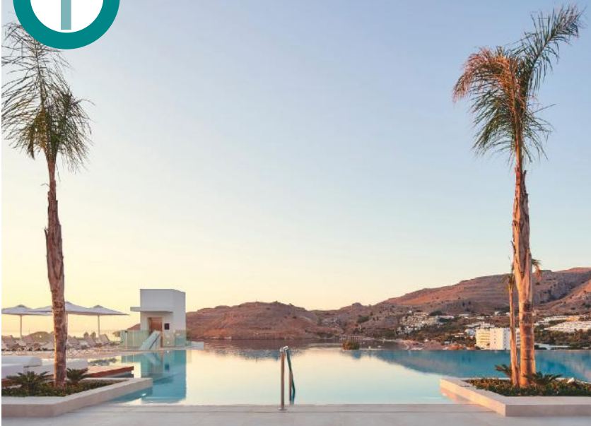
Lindos Grand Resort & Spa, Greece