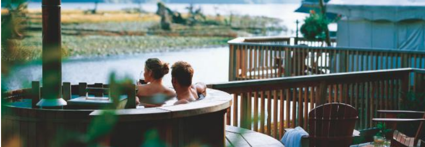
Clayoquot Wilderness Lodge, Canada

SOURCE: National Wedding Survey of 1,808 couples who married in 2023, via hitched.co.uk