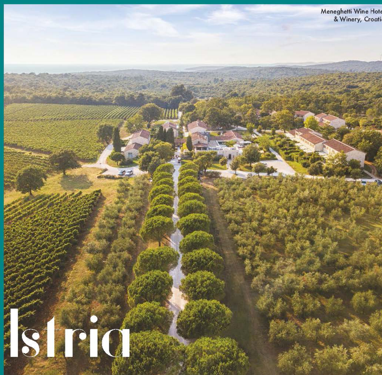
Meneghetti Wine Hotel & Winery, Croatia

For those willing to get off the beaten track and into the mountains, hills and lakes that define this region, these countries offer history and hospitality by the bucketload. Travel Weekly selects three different ways for clients to get up close and personal with this riveting region.