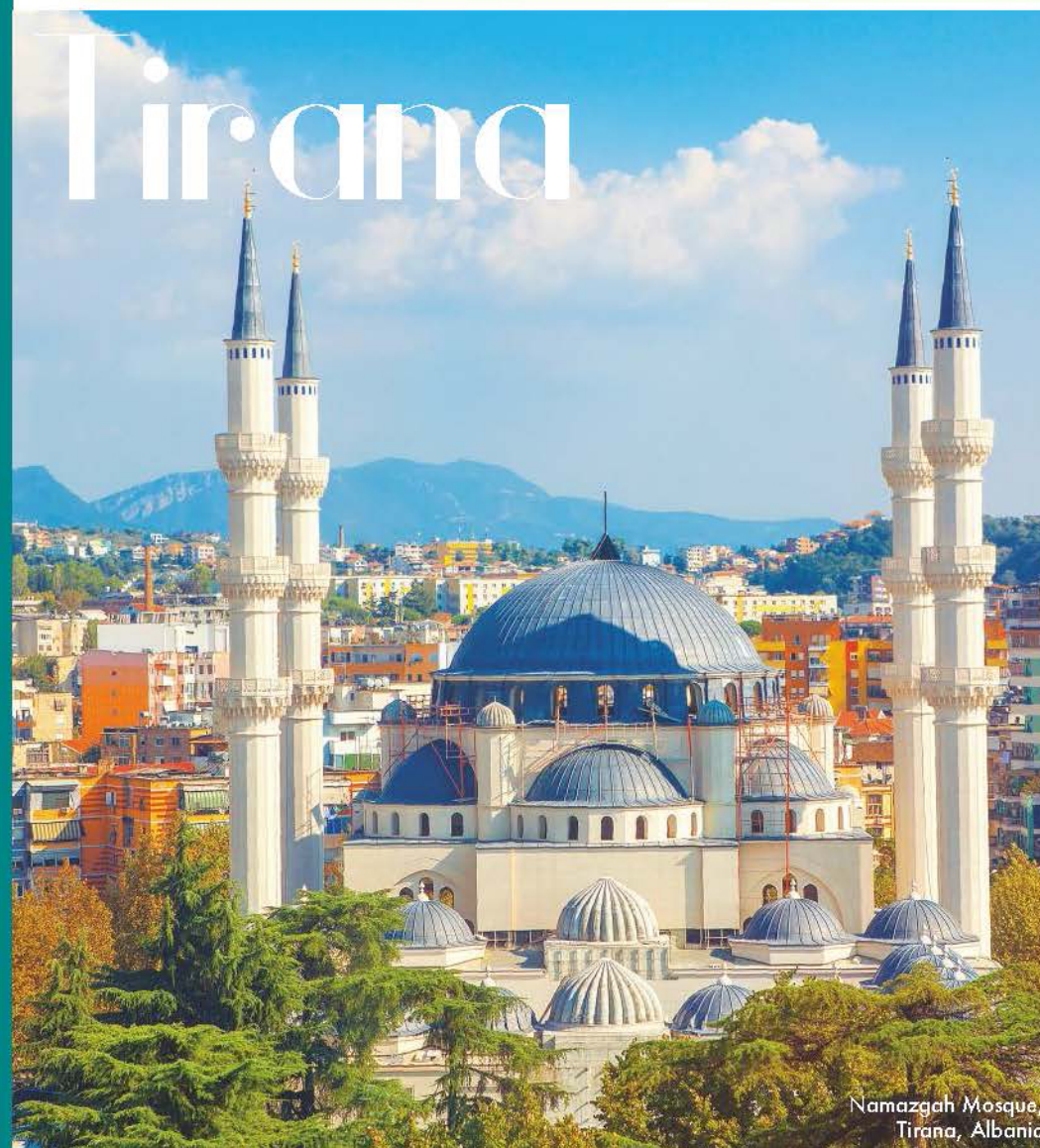
Namazgah Mosque, Tirana, Albania

Book it: Tui offers three nights' B&B at the Hotel Teatro from £329 per person, based on two sharing. The price includes 20kg of hold luggage and flights from Stansted on July 1. tui.co.uk