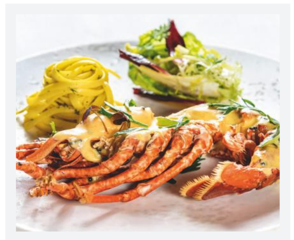
FROM TOP: Bovey Castle; Great Western Grill serves whole grilled native lobster

Bovey Castle is sold through Abercrombie & Kent and InterContinental Hotels Group. Rooms cost from £239 per night, based on two adults sharing on a bed-and-breakfast basis. Lodges are available from £649 per night, based on up to six adults sharing on a self-catering basis. boveycastle.com