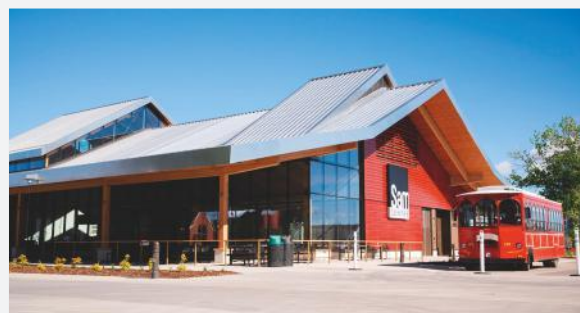
TOP: Footage from Calgary Stampede on display