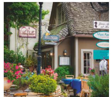
CLOCKWISE FROM TOP: Monterey Bay Aquarium; shops on Ocean Avenue, Carmel-by-the-Sea; Carmel Beach; Monterey Canning Company, Cannery Row

My previous visit predated the smartphone, but now celebrating its 40th anniversary, the world-famous facility is a must-see attraction in Monterey. The not-for-profit organisation is a leader in science education and a global voice for ocean conservation through active programmes in marine science and public policy. More than two million visitors a year enter its doors to marvel at the impressive exhibits.