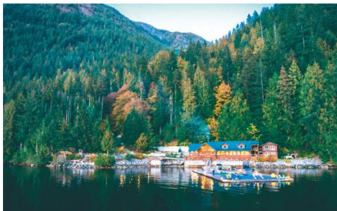
CLOCKWISE FROM LEFT: Klahoose Wilderness Resort; northern lights in Yukon; Sulphur Mountain, Banff National Park