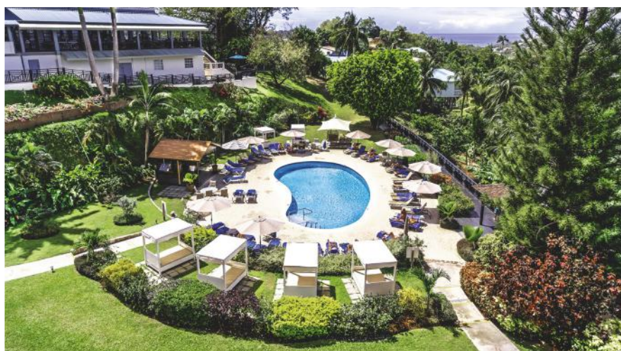
CLOCKWISE FROM TOP LEFT: The Club Barbados Resort & Spa, Barbados; kayaking at The Club Barbados; Bel Jou, Saint Lucia; The Fives Oceanfront, Mexico

Castries. Perched on the hillside, surrounded by tropical gardens and wildlife, it's the perfect place to unwind. There's a rooftop lounge, two pools and a buffet restaurant specialising in Creole cuisine that offers views of the island's vibrant capital. And if guests do fancy something more energetic, they can take part in daily activities such as Pilates or dance classes.