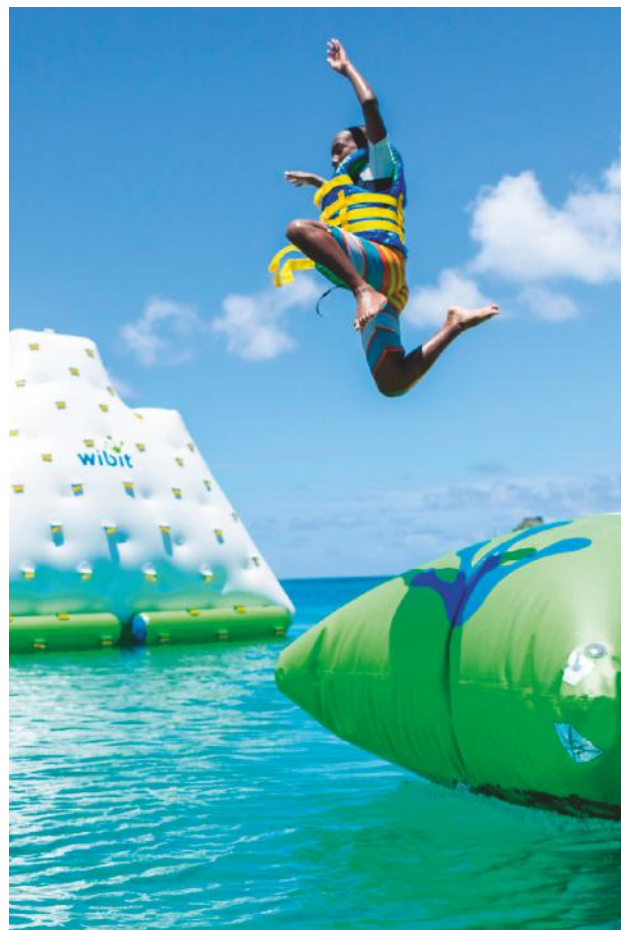
CLOCKWISE FROM TOP: Club Med Punta Cana, Dominican Republic; Bay Gardens Inn, Saint Lucia; Magdalena Grand Beach & Golf Resort, Tobago

archery, sailing and stand-up paddleboarding all on offer. Those looking for something a bit different can take dance lessons or even have a go at learning some circus or trapeze tricks.