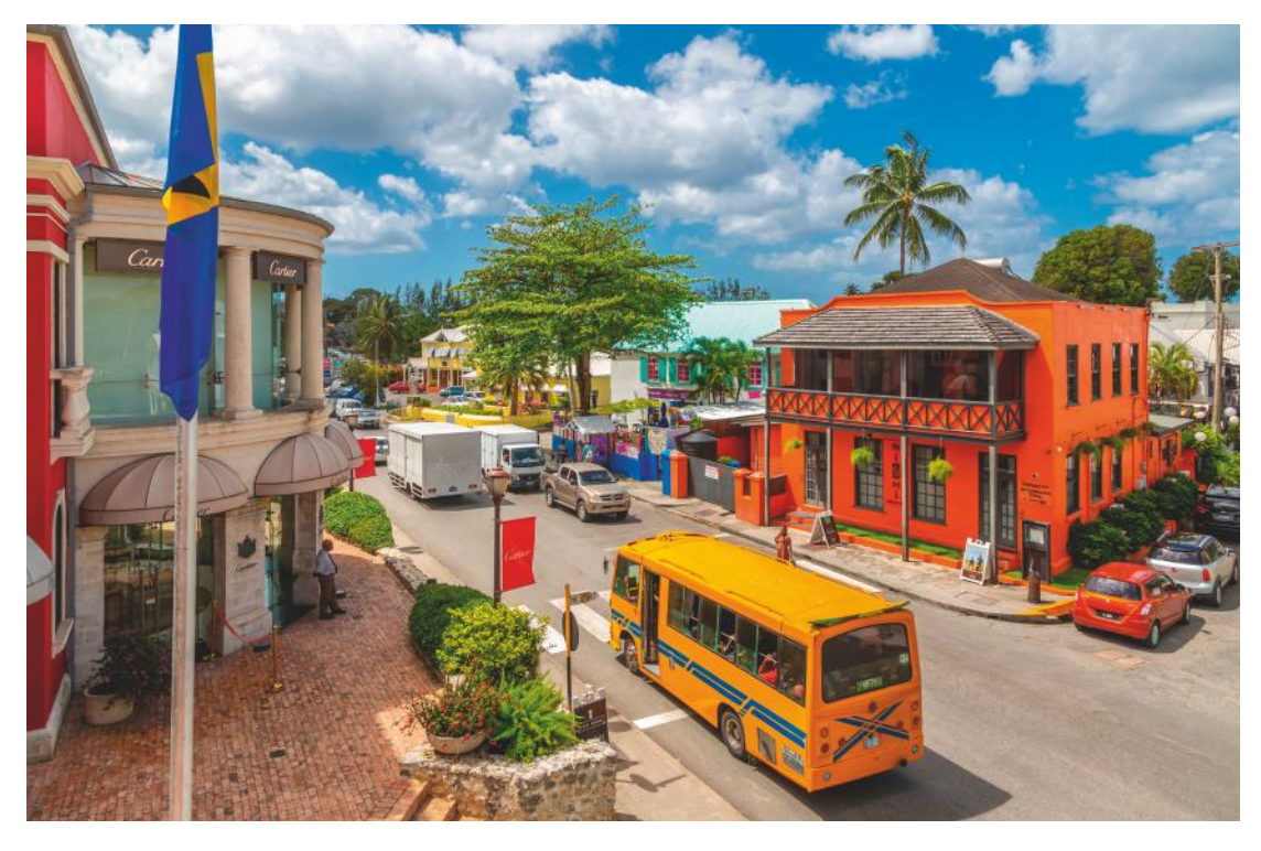
ABOVE: A 'reggae reggae' bus in Holetown, southwest Bardados

within the island's high-end hotel scene, differentiating itself from the plantation-style hotels and the all-singing, all-dancing resorts.