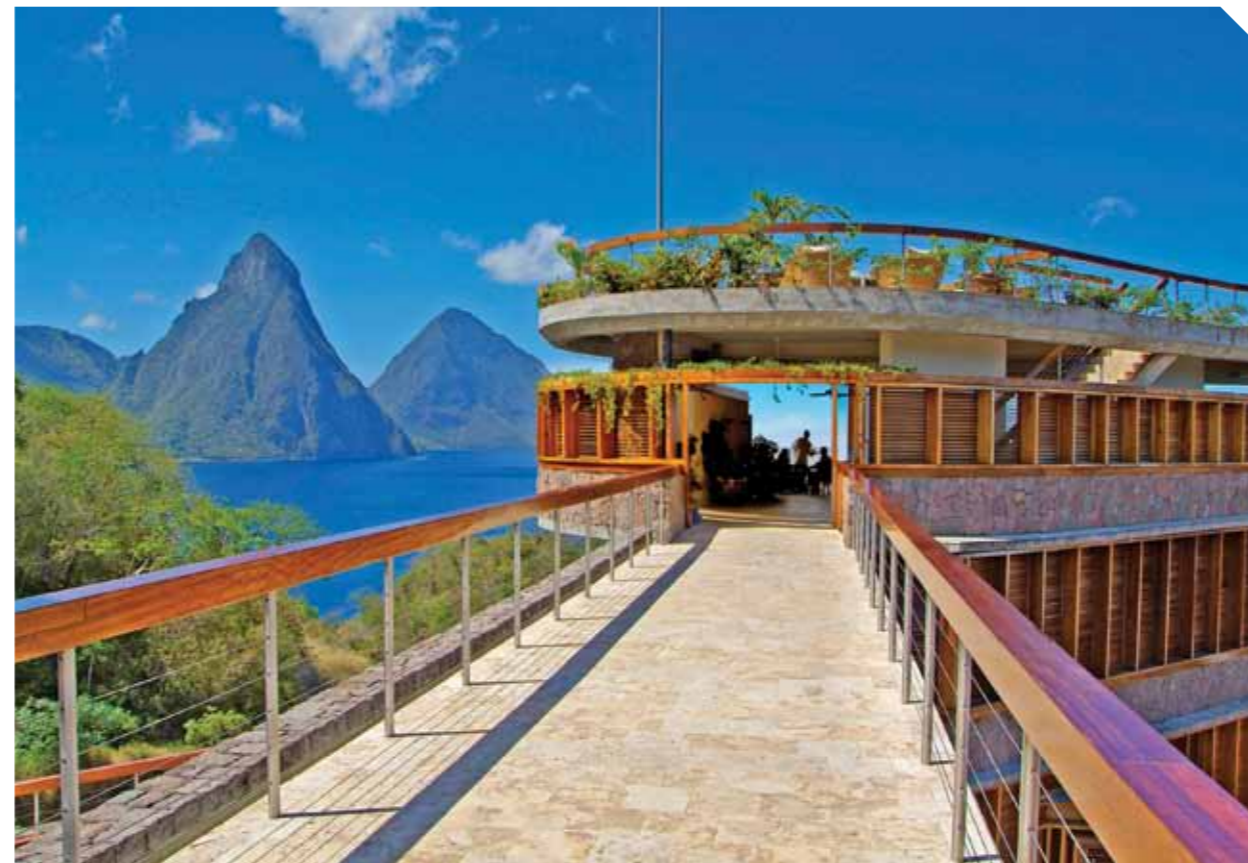
ABOVE: Verandah Resort & Spa