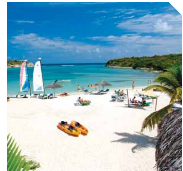
ABOVE: Verandah Resort & Spa

SPLURGE Carrier offers seven nights for the price of six at Jade Mountain in Saint Lucia from £5,045, based on two adults sharing a Star Sanctuary on an all-inclusive basis, with British Airways flights from Gatwick and transfers. Offer valid for travel until December 19. carrier.co.uk