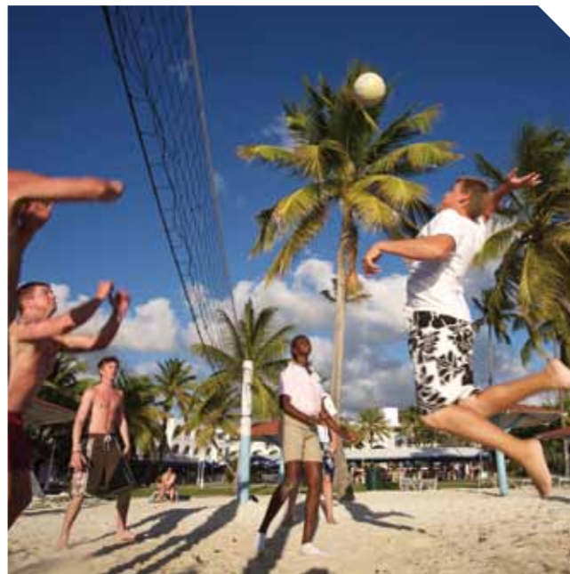
LEFT: Jolly Beach Resort & Spa