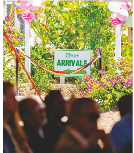
ABOVE: Barbuda International airport

Winair: Dutch airline based in Sint Maarten with flights to Antigua, Dominica, St Kitts and Tortola in the British Virgin Islands. winair.sx