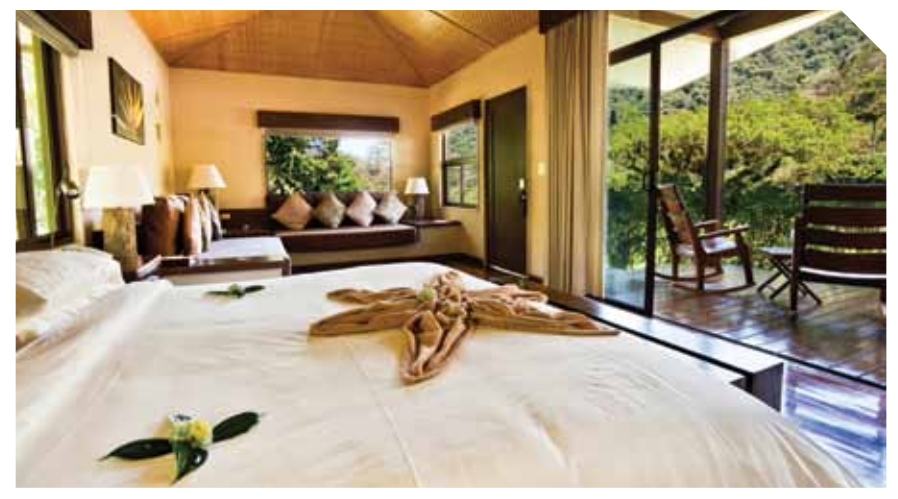
ABOVE: El Silencio Lodge & Spa

Recommend clients start or end their trip with a few nights at Hotel Grano de Oro in the capital, San Jose. Chic rooms (from £100 per night) at the restored Victorian mansion have marshmallow-soft beds, thick robes and period furniture. Some have private patios with trickling fountains.