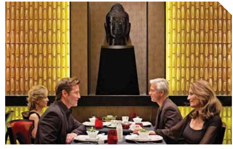
ABOVE: Red Ginger restaurant, Oceania Cruises

WHAT'S NEW? Carnival Cruise Line is back in the Mediterranean