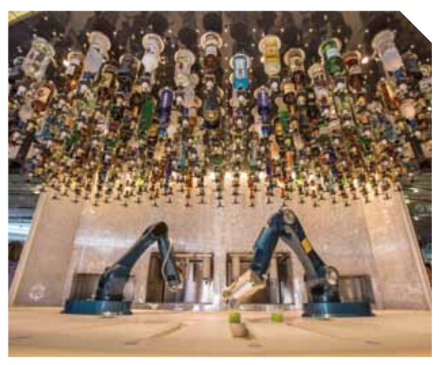
ABOVE LEFT: Carnival Vista

LEFT: Bionic bartenders, Roval Caribbean