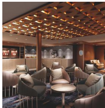
CLOCKWISE FROM TOP: Cologne; Norwegian Cruise Line's Studio Lounge on Encore ; Riviera Travel's Geoffrey Chaucer, relaxing on board

and was moved when a cabin steward remembered her and her husband from several years before. Since then, she has clocked up 574 sea nights with the line, sails on an average of five cruises a year and has 10 booked through to 2025, including a 24-night cruise to destinations including Cape Town.