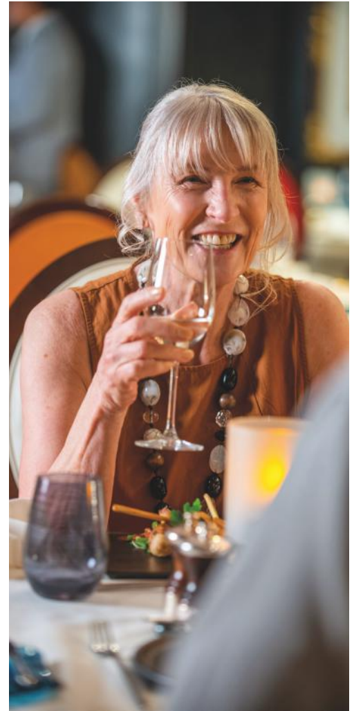
CLOCKWISE FROM TOP LEFT: Bolette in port; dinner in the Colours & Tastes restaurant; dolphin watching; enjoying the friendly atmosphere