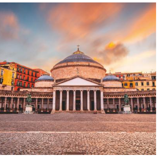
FROM LEFT: Wintergarden lounge on Viking Mars; Naples, Italy

The 930-passenger vessel Viking Mars was named in Malta in May 2022: the event marked a double celebration as last year was the 25th anniversary of Viking, which began with river cruises in Russia and grew into the world's largest river cruise line.