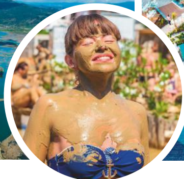
CLOCKWISE FROM LEFT: Tomb temples cut into the rocks at Kaunos; Liberty Fabay hotel, Fethiye; mud bath, Dalyan; and İztuzu Beach