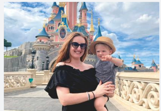
TOP: Buzz Lightyear in Toy Story Playland ABOVE: Hollie and Theo by Sleeping Beauty Castle

Disneyland Paris offers two nights from £368 per person including accommodation at Disney Hotel New York – The Art of Marvel. The price includes flights with EasyJet and unlimited park access. Children under two travel for free. disneytravelagents.co.uk