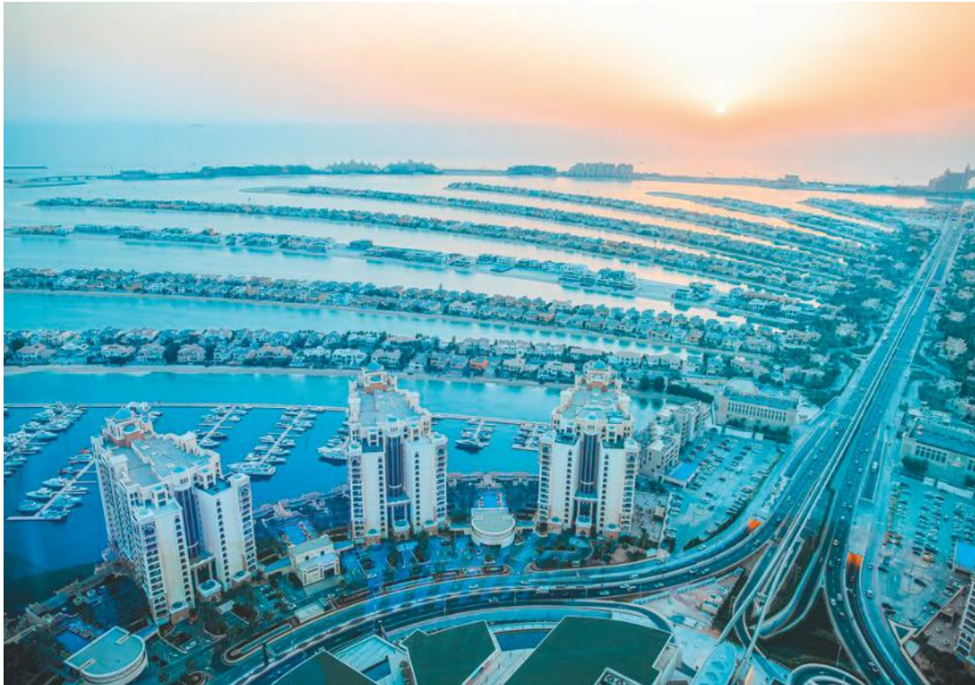
ABOVE: Looking out from The View at The Palm over Palm Jumeirah