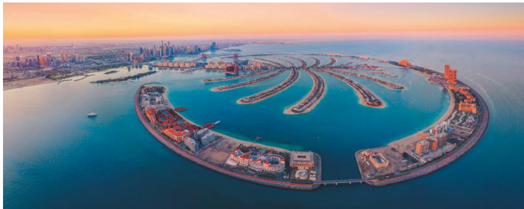
CLOCKWISE FROM LEFT: Palm Jumeirah; Piatti by the Beach at Raffles The Palm Dubai; Marriott Resort Palm Jumeirah; view of Atlantis The Palm from The Pointe