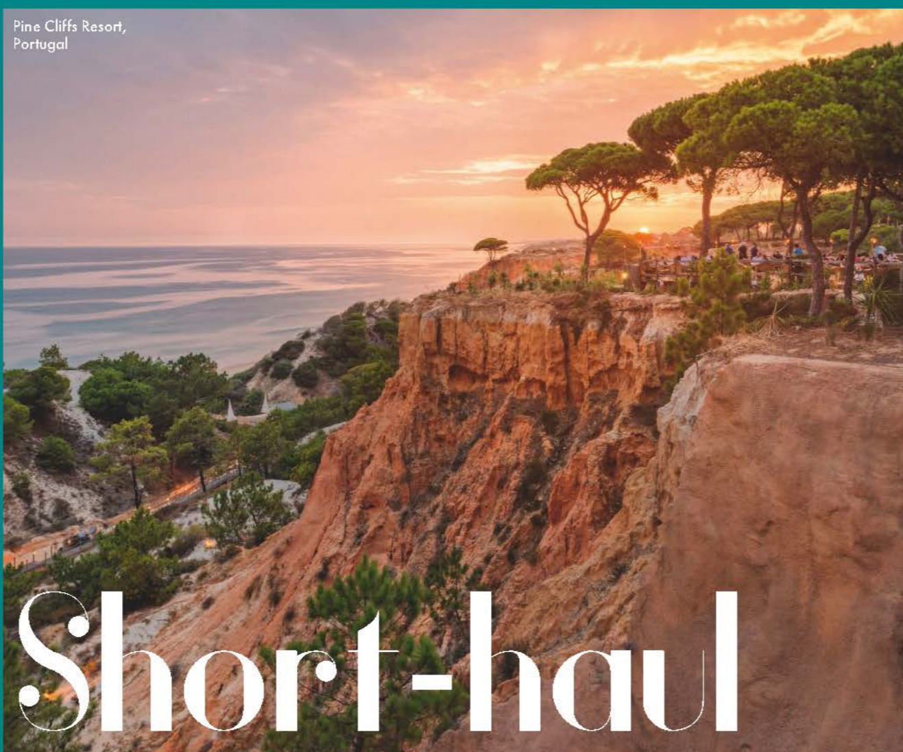
Pine Cliffs Resort, Portugal

The cost-of-living crisis may mean some are tightening their belts and seeking shorter trips closer to home, but others may be looking for that once-in-a-lifetime holiday somewhere far-flung before their kids get too old. From cultural experiences to poolside fun, here are nine holidays that cater for every sort of family fun this Easter.