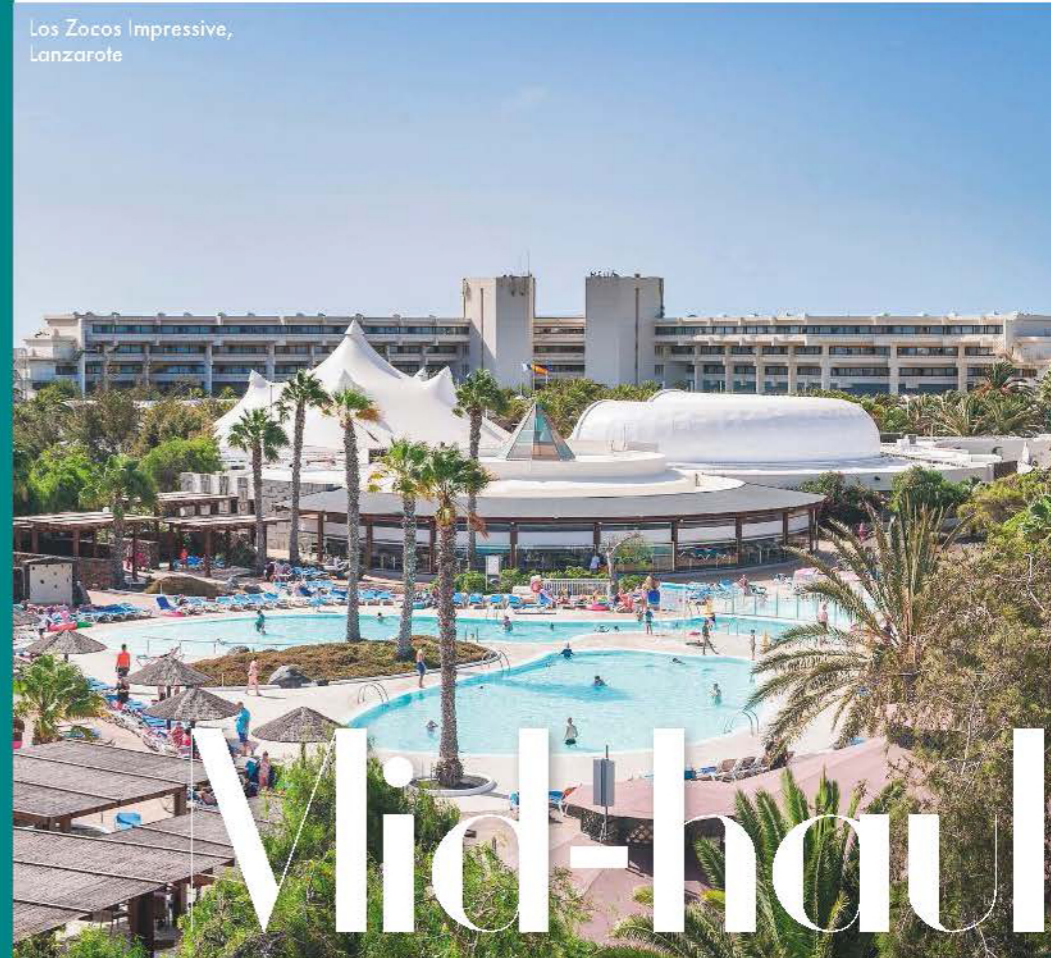
Los Zocos Impressive, Lanzarote

Book it: EasyJet holidays offers seven nights on an All Inclusive Plus basis for £508 per person, including 23kg luggage, transfers and flights from Bristol on April 4. easyjet.com/holidays