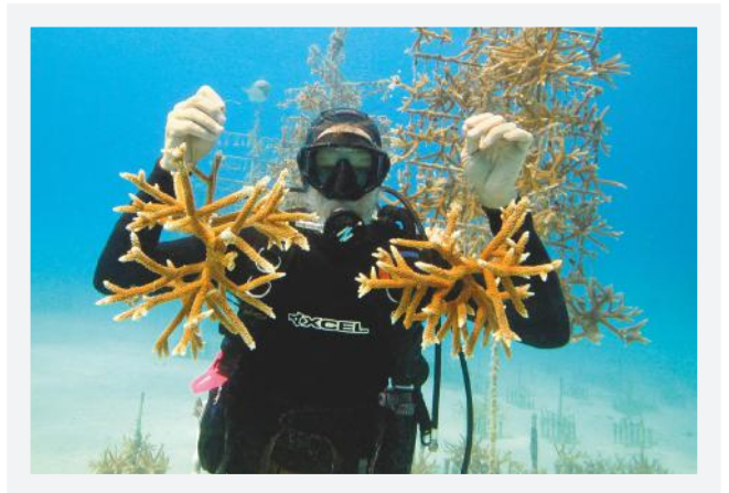
TOP: Exploring the mangroves with Big Pine Kayak Adventures ABOVE: The CRF's offshore coral nurseries

American Affair offers a 10-day Florida Keys Highlights Fly Drive from £1,988 per person based on two adults sharing, departing May 1, 2022. The price includes flights from Heathrow, accommodation and 10 days' car hire with full insurance. americanaffair.com