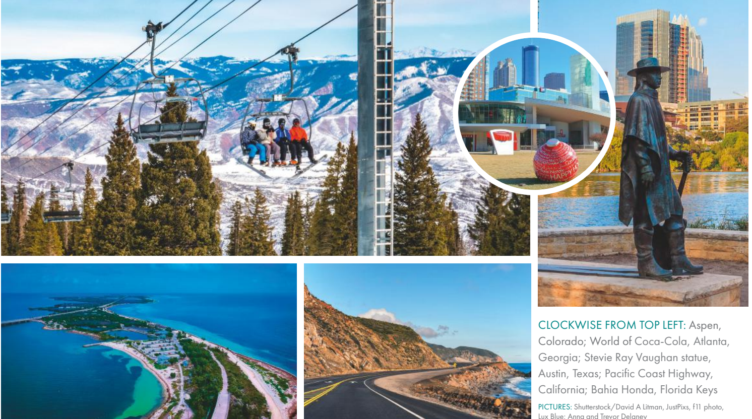
CLOCKWISE FROM TOP LEFT: Aspen, Colorado; World of Coca-Cola, Atlanta, Georgia; Stevie Ray Vaughan statue, Austin, Texas; Pacific Coast Highway, California; Bahia Honda, Florida Keys