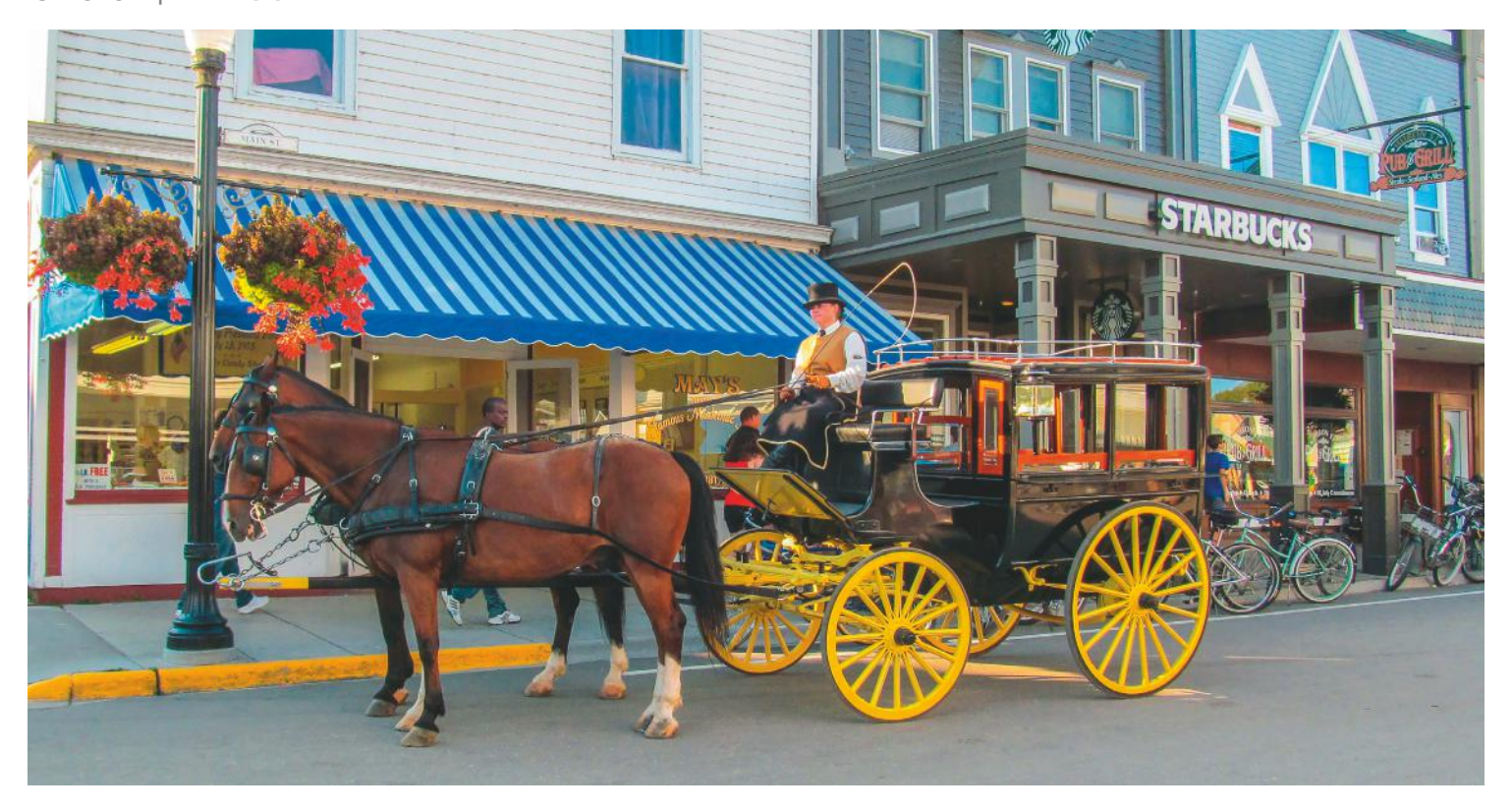
ABOVE: Horse-drawn carriage on traffic-free Mackinac Island in Lake Huron BELOW: Heavy horses deliver supplies to Ocean Voyager

trains and planes. Neighbouring Greenfield Village is a living history museum where you can take a stately ride around the streets in a Model T.