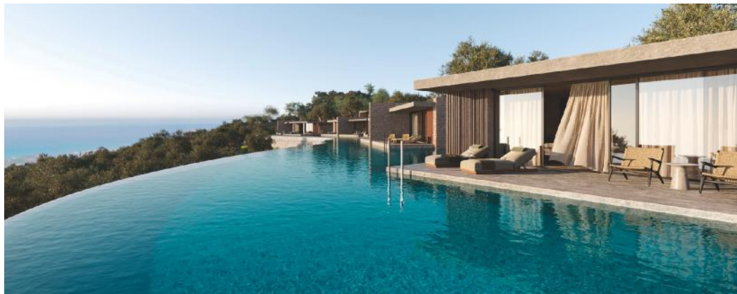
CLOCKWISE FROM LEFT: King Jason Zante; Zoëtry Halkidiki Resort & Spa; Hard Rock Hotel and Casino; Cali Resort