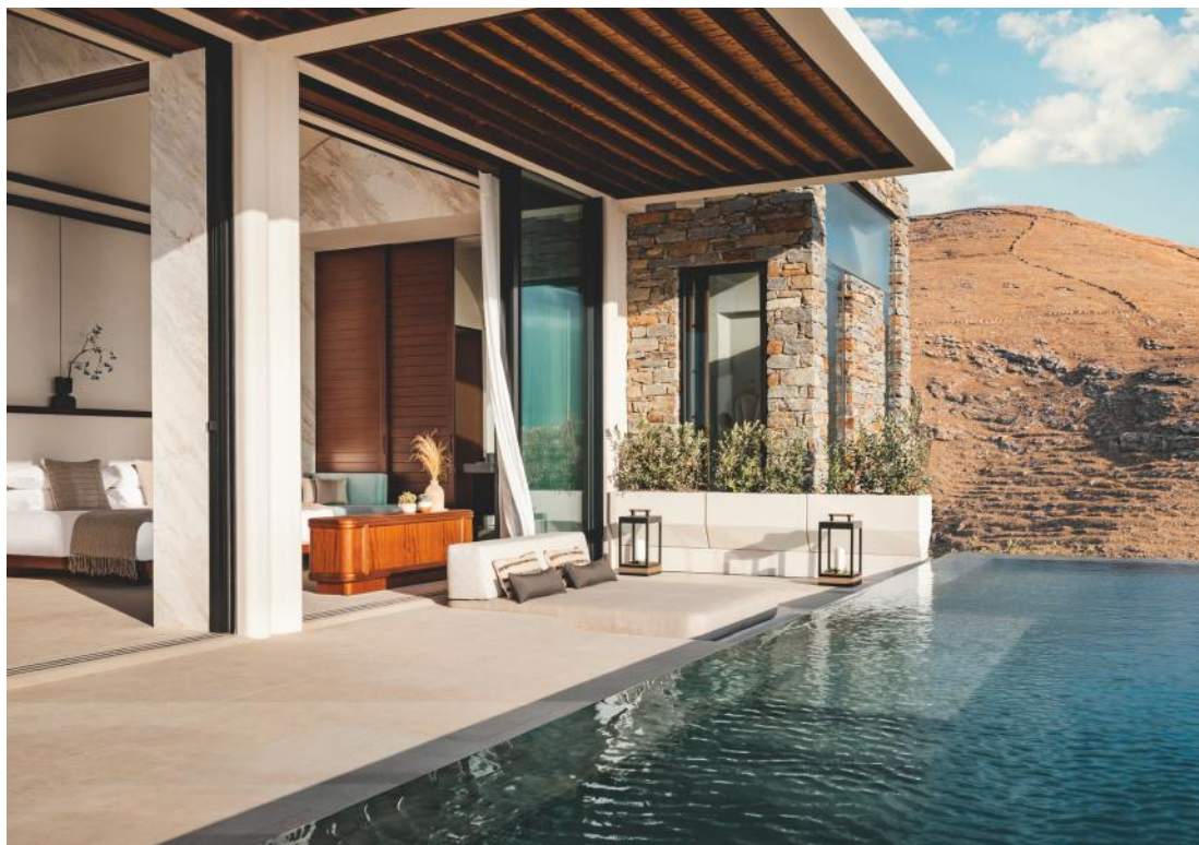
The all-villa One&Only Kéa Island, which will feature a Guerlain spa, opens in May

first five-star hotel: the design-led Gundari will comprise 27 villas and suites built from local materials, a restaurant with a Michelin-starred chef and a wellness programme that takes its inspiration from ancient Greek medicinal rituals.