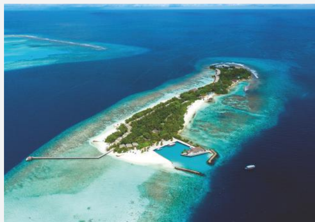
TOP: Maldivian fishermen at sunset ABOVE: Oblu Nature Helengeli by Sentido

Beachcomber Tours offers a seven-night stay at Oblu Select Helengeli by Sentido in a Deluxe Beach Villa from £3,195, including Etihad flights departing on March 4, 2024. The all-inclusive Island Plan includes speedboat transfers, unlimited use of snorkelling equipment, sunset fishing excursion and a visit to a local island. beachcombertours.co.uk