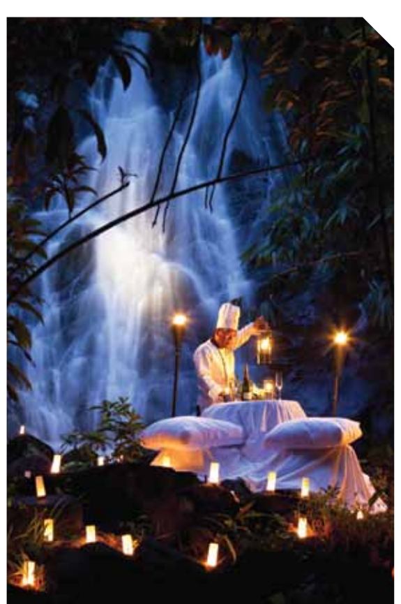
LEFT: The Sarojin, Thailand