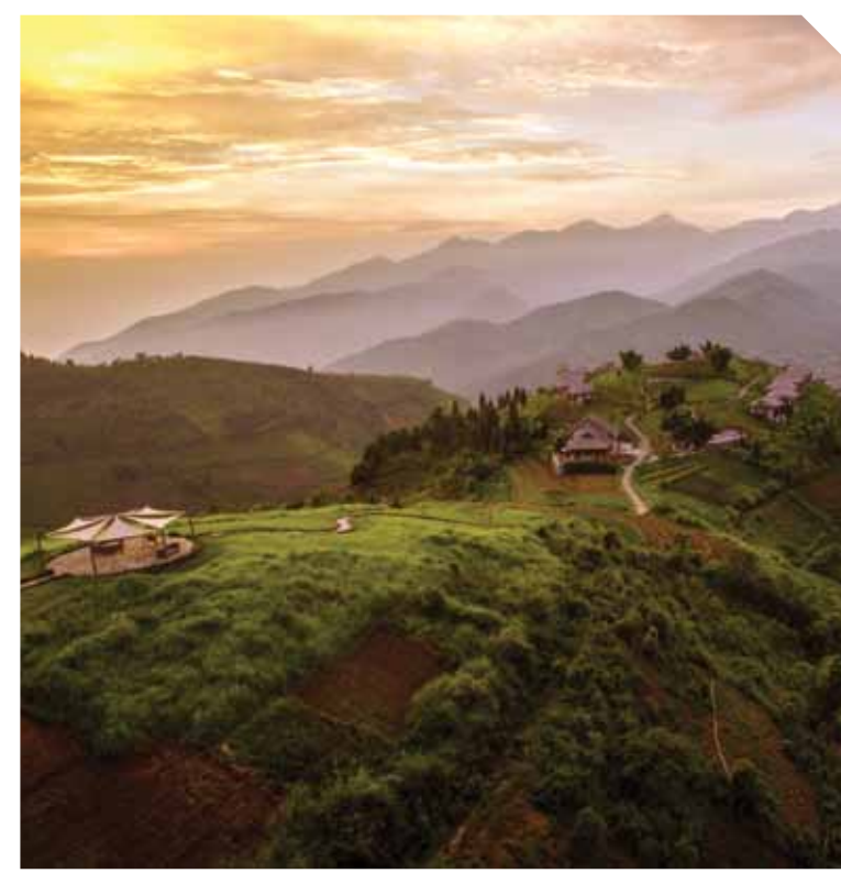
ABOVE: Topas Ecolodge, Vietnam LEFT: Fusion Maia, Vietnam BELOW: Kata Rocks, Thailand