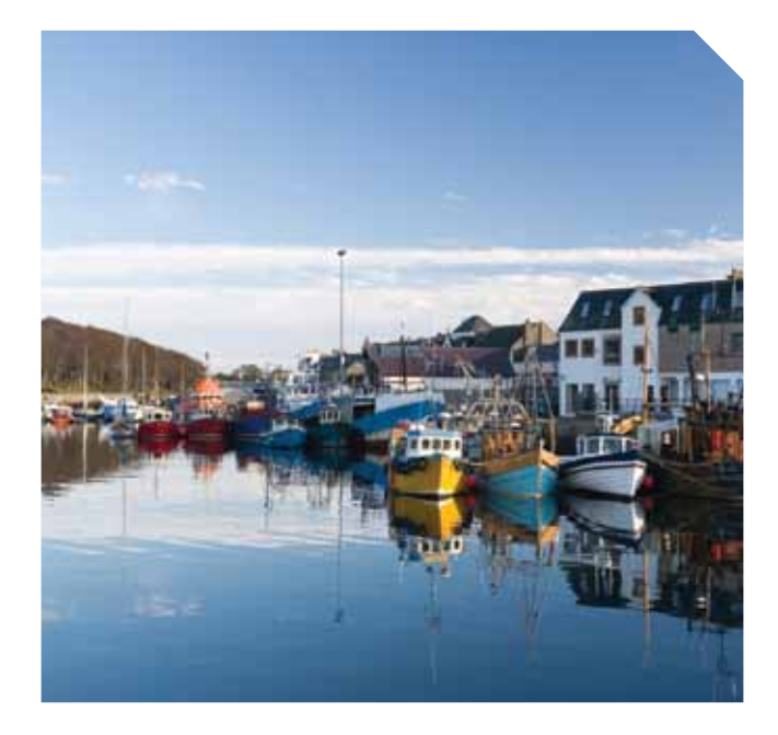
LEFT: Crete, Greece BELOW: Stornoway, Isle of Lewis

Intrepid Travel's new sailing tours include a Sardinia & Corsica Adventure and a trip down France's Canal du Midi. Both are eight days, starting at £930 and £1,035 respectively intrepidtravel.com