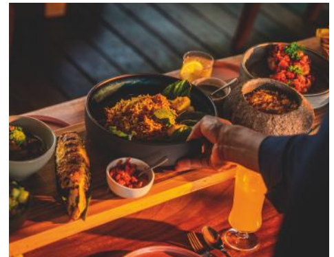
ABOVE AND RIGHT: Sandals Saint Vincent and the Grenadines; the resort's Buccan restaurant TOP RIGHT: Dark View Falls, St Vincent

Bequia is also benefiting from a new dedicated fast ferry that offers a 40-minute connection to St Vincent, making the larger island easier to visit on a day trip. Capital Kingstown offers plenty of cultural draws, including botanical gardens established in 1765, alongside active options such as hiking up the 1,235-metre La Soufrière volcano.