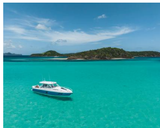
CLOCKWISE FROM TOP: The Rock Villa at Bequia Beach Hotel; Tobago Cays Marine Park; Soho Beach House Canouan

played for free, are open at present – there is limited sign of damage. I found an optimistic mood that makes this off-radar isle a standout pick for clients seeking a safe, quiet and upmarket Caribbean getaway.