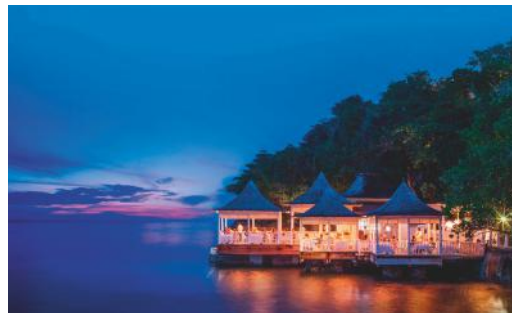
CLOCKWISE FROM TOP: Moon Palace Jamaica; Bayside Restaurant, Couple Tower Isle; Lagoon Cottage, GoldenEye

➤ from the 55 cottages and suites to the elegant lawns where croquet is still played. Two perfect Ocho Rios beaches, a dining terrace to die for and a new relaxed restaurant serving pizza on the beach make it nigh-on perfect. Book it: From $469.50 per room, per night, room-only. jamaicainn.com