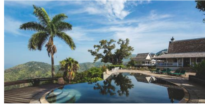
TOP: H10 Ocean Eden Bay BOTTOM: Strawberry Hill