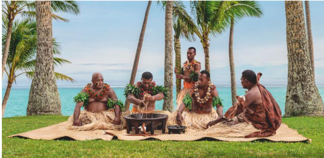
CLOCKWISE FROM LEFT: Kava beach ceremony, Fiji; Costa Rica's Nicoya Peninsula attracts the right kind of visitor; enjoying the Norwegian fjords; Elsanranta Villas at Sahanlahti Resort, Finland