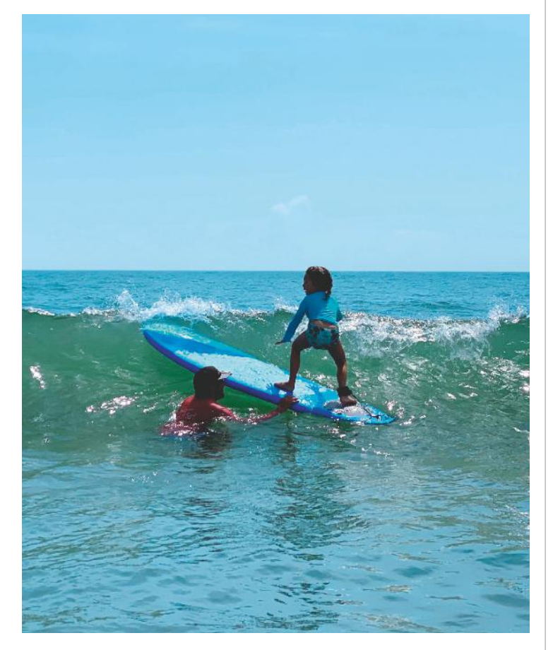
ABOVE: Ride the waves with the School of Surf in Cocoa Beach