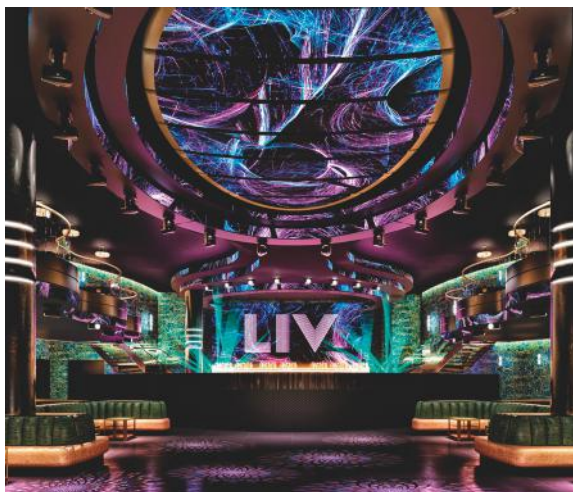
CLOCKWISE FROM LEFT: Liv nightclub, Fontainebleau; Las Vegas Caesars Palace; Luxor; the Wynn

Virgin Atlantic is the only airline to fly from Manchester to Las Vegas. This means direct flights to the US's West Coast, allowing you to offer clients trips incorporating Vegas.