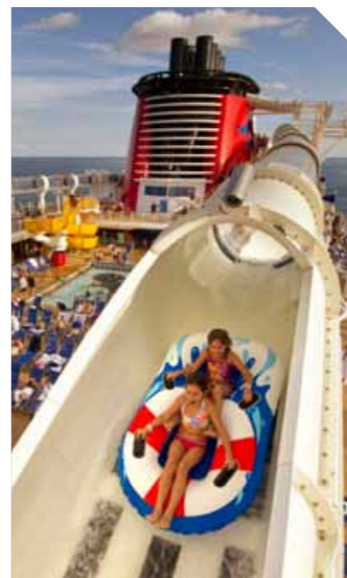
RIGHT: Castaway Cay BELOW: Aqua Duck

The three main restaurants – Enchanted Garden, Animator's Palate and Royal Palace – are based on a rotational dining system. You eat at a different one each evening and the