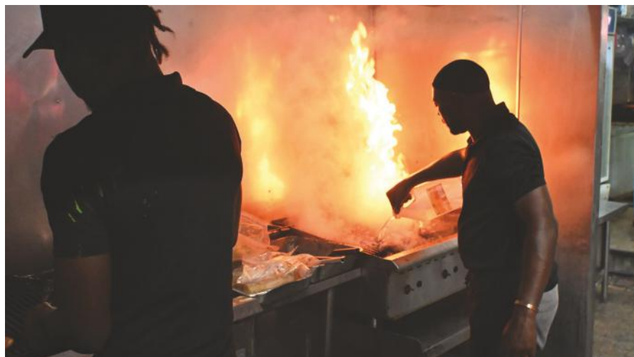
ABOVE: The Oistins Fish Fry is a Friday night institution

Run Barbados Marathon Weekend (December): The long-standing Barbados Marathon weekend sees runners follow a 26-mile route along the east coast. Wellness activities, including yoga and nature walks, are also on the agenda.