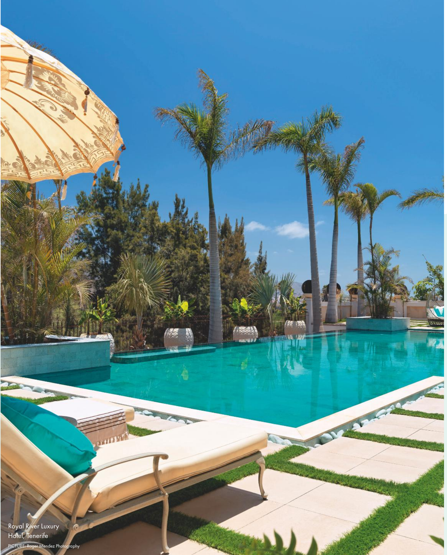
Royal River Luxury Hotel, Tenerife