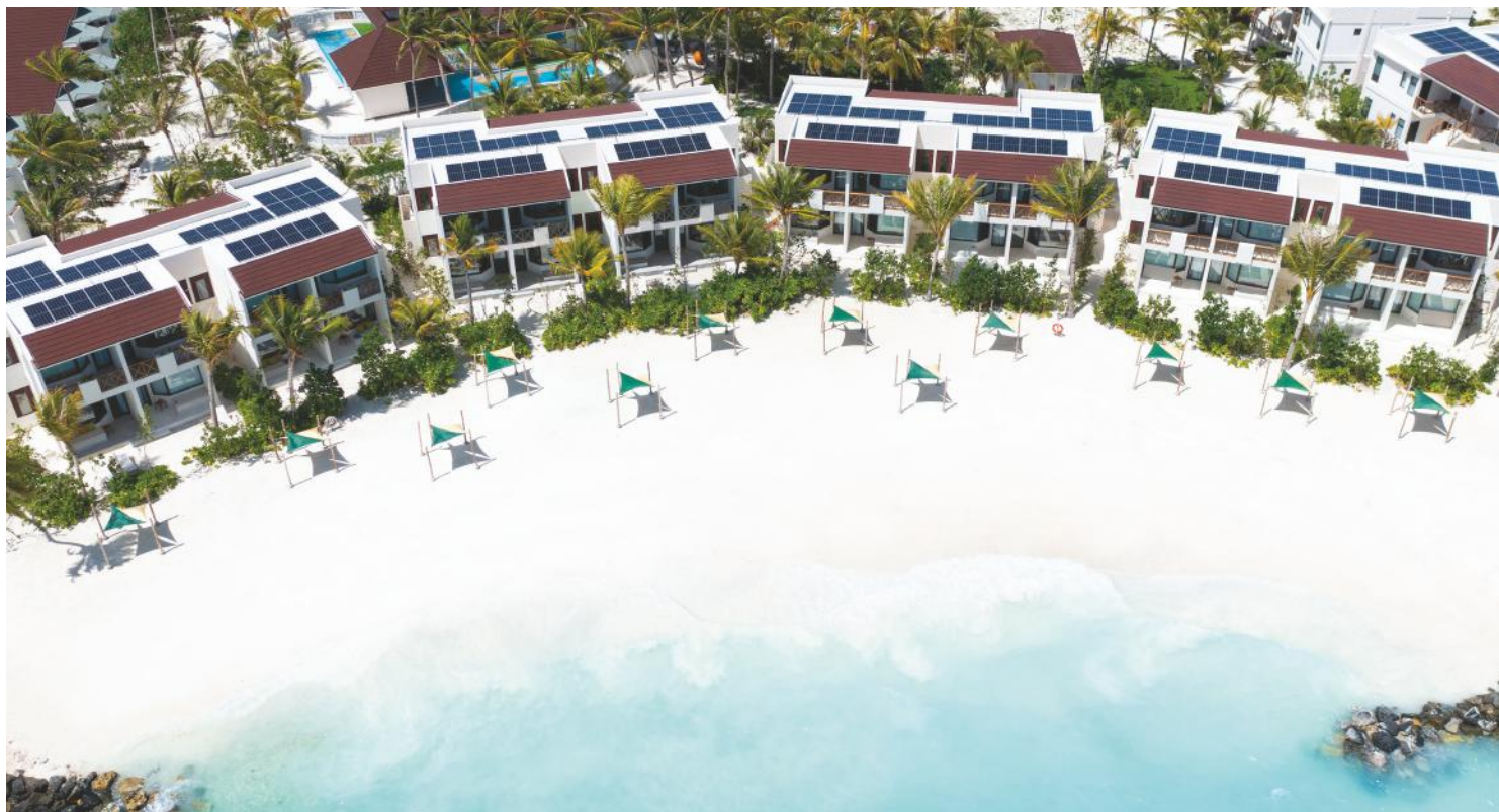
ABOVE: All-inclusive property Oblu Xperience Ailafushi

new, while Origami, which specialises in Japanese fare (including robatayaki – cooking over charcoal) and the oceanfront Dhoni Bar have been renovated.