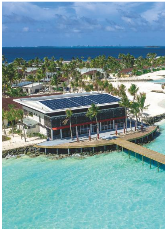
ABOVE: Arrival jetty at Oblu Xperience Ailafushi

room. My building also has the lively X360 Bar, which is ideal for those who like a party.