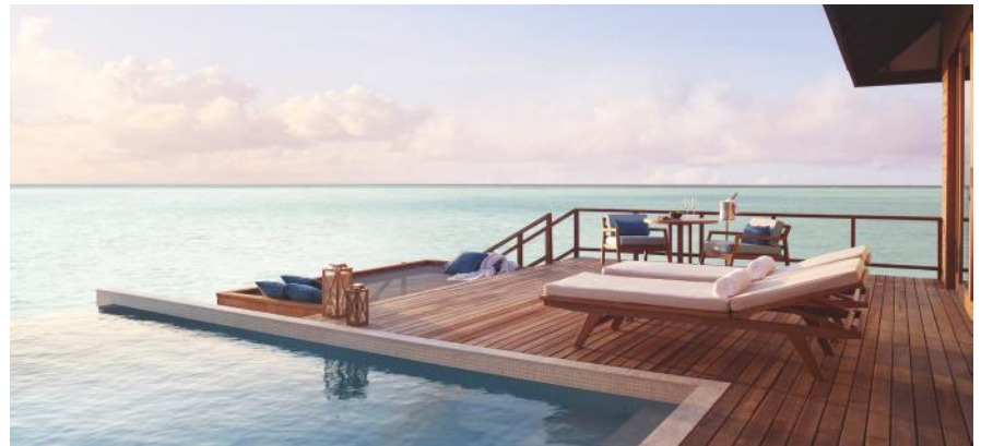
CLOCKWISE FROM TOP LEFT: Aerial view of Anantara Veli Maldives Resort; pool at Hilton Maldives Amingiri Resort & Spa; Deluxe Over Water Pool, Anantara Veli Maldives Resort; restaurant at Hilton Maldives Amingiri Resort & Spa

Asian koels (glossy-feathered birds famous for their shrill calls) suggests that nature is already thriving here. The vegetation even extends to the overwater boardwalks, lined with bright green shrubs.