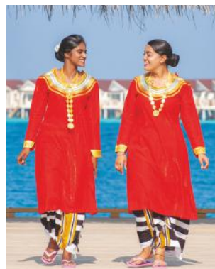
CLOCKWISE FROM TOP: Aerial view of Oblu Select Lobigili; island hostesses; underwater restaurant Only Blu