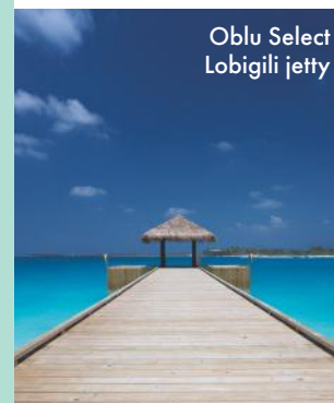
Oblu Select Lobigili jetty

“The Maldives continues to be one of Pacific Asia's most popular holiday destinations, proven in a recent poll of our Pata agents. Almost a fifth (19.6%) of bookings made are to the Maldives and 51% are for winter 2022-23. Agents also reported that 42% of their clients are willing to spend more on travel and upgrade their holidays, which is why luxury beach holidays are thriving. While the Maldives remains an incredibly popular honeymoon destination, and it's boom is partly due to postponed wedding and honeymoon plans finally taking place, post-Covid travellers are also seizing the moment and spending pent-up holiday budget on blow-out trips. With several new resorts, from affordable to uber-lux, the islands have never been more accessible to couples seeking a romantic getaway.”