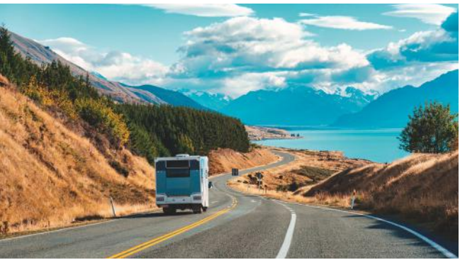
CLOCKWISE FROM TOP: Bryce Canyon, US; South Island, New Zealand; Mount Cook, New Zealand