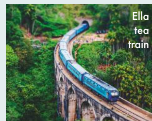
Ella tea train

Not In The Guidebooks has introduced an Immersive Country and Coast adventure, where clients hit Sri Lanka's Cultural Triangle and ride the Ella tea train before unwinding at the beach in Tangalle, a quiet, palm-lined stretch on the south coast. From £2,270 for 12 nights, with accommodation, activities, select meals and transfers. Departs May 1 or September 1. notintheguidebooks.com