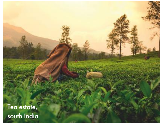
Tea estate, south India

new 16-day Wild Sri Lanka tour. Expect elephants, leopards and sloth bears roaming free, plus a mix of national parks, temples and coastal lagoons to explore. It is priced from £3,299, including accommodation, transfers, flights from Heathrow, listed experiences and select meals. Departs June 15, 2027. rivieratravel.co.uk