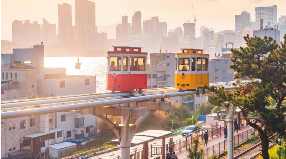
Haeundae Sky Capsule, South Korea