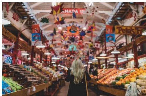
CLOCKWISE FROM TOP: St Martins Sea Caves; Saint John City Market; St Andrews

Of course, the best way to see any new city is with a local tour, preferably one with plenty of beer involved like Uncorked NB. There are 60 breweries in New Brunswick alone, including Moosehead, the oldest independent brewery in Canada. I do my best to taste as many as I can on a drinking tour of the city. Starting from Saint John City Market, it explores New Brunswick's history and brewing heritage through its local boozers. To soak up the 160 billion tons of beer it feels like I've sampled, a plate of Digby bacon maple scallops followed by shaved beef rib and mash at Saint John Ale House on the waterfront do their best to sober me up.