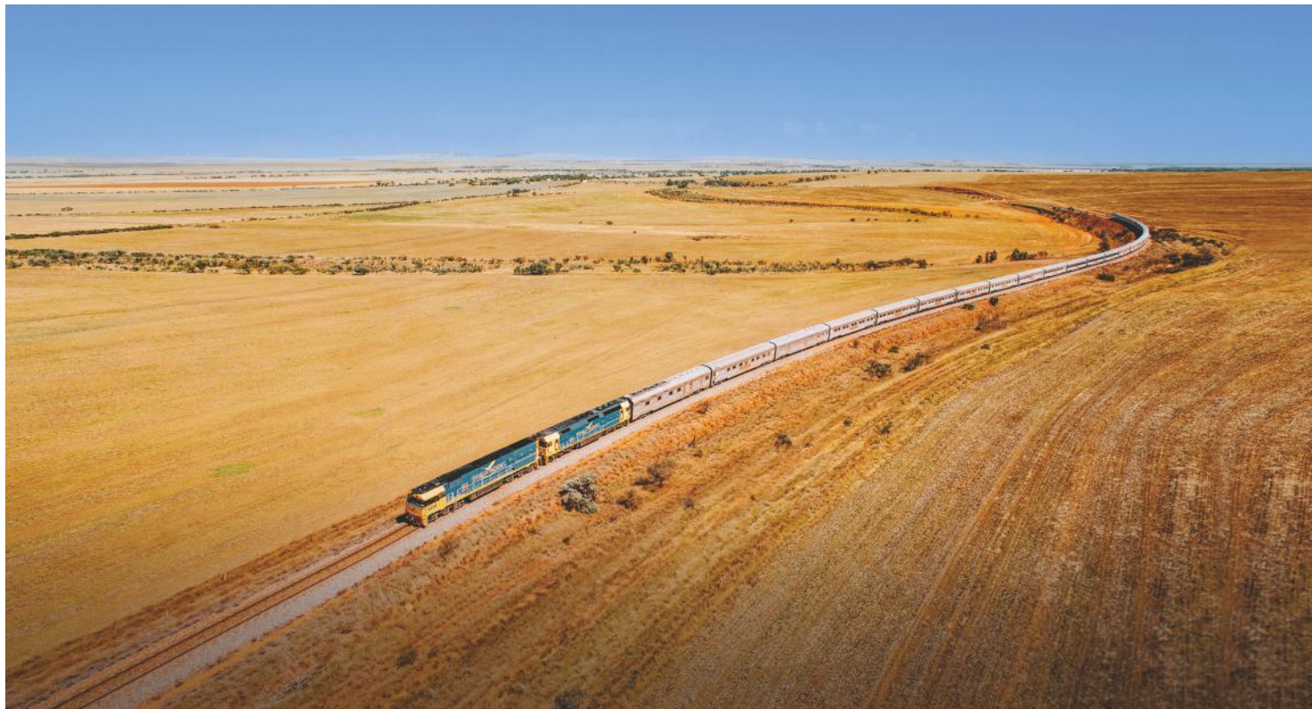
OPPOSITE, CLOCKWISE FROM TOP LEFT: Mountain scenery near Skagway, Alaska; bar area on Britannic Explorer; Vistadome train, Peru ABOVE: The Indian Pacific offers four-night journeys across Australia between Perth and Sydney

all-encompassing glimpses of the Sacred Valley. Passengers are treated to theatrical performances en route, from Andean dances to an alpaca clothing fashion show.