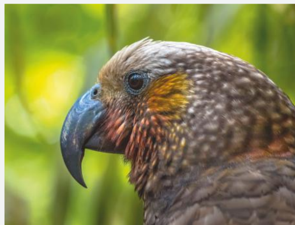
TOP: Kapiti Island is a 20-minute boat ride from North Island ABOVE: The kaka parrot is endemic to New Zealand

Audley Travel offers tailor-made itineraries to New Zealand. A 19-day trip to the North and South islands, visiting Kapiti Island, Wellington, Mount Cook and Queenstown, costs from £6,850 per person, based on two sharing. The price includes all flights, B&B accommodation, hire car and excursions. audleytravel.com/new-zealand