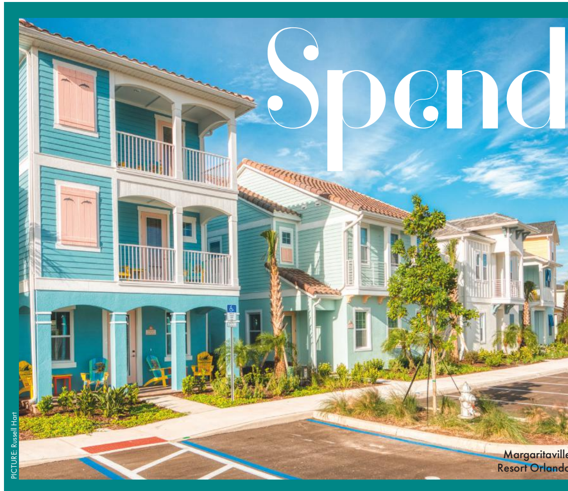
Margaritaville Resort Orlando

“At Visit Orlando, we’ve set a goal to reach 80 million visitors by 2024, and we are steadily making progress. “Orlando offers a variety of accommodation options for every budget, and it’s not only for families. Couples who want to experience Orlando like a local, Downtown Orlando or Winter Park are excellent options. “Hotels in the tourism corridor cater to adults, with amenities including world-class spas, chef-driven restaurants and adult-only pools. Four Seasons Resort Orlando at Walt Disney World Resort and The Ritz-Carlton Orlando, Grande Lakes both now feature Michelin-starred restaurants. “For travel agents selling the destination, Visit Orlando offers a variety of useful resources, and the Orlando Travel Academy features interactive sales tools and an on-demand training curriculum, so I recommend making the most of them.”