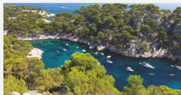
TOP: Colourful boats and harbourside cafes in Cassis ABOVE: Calanque de Port Pin, Marseille

Railbookers offers a four-day Marseille and Cassis City Break by rail from £986 for a solo traveller, departing on May 28, 2026, from London St Pancras. Includes all rail transport and accommodation with breakfast. railbookers.co.uk