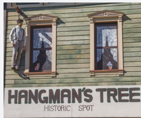
TOP: Main Street, Placerville

American Affair's 15-night Northern California Highlights by Motorhome trip starts in San Francisco, visiting Sonoma, Eureka, Yosemite National Park and including the journey from Lake Tahoe to Sacramento, via Placerville. Prices start at £1,568 with economy-class flights, two nights' accommodation and 14 nights' motorhome hire, departing September 8. americanaffair.com