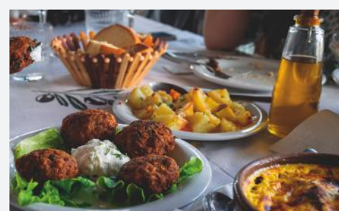
TOP: Skanderbeg Square, with Et'hem Bey Mosque ABOVE: Traditional Albanian cuisine

Tui sells a four-night stay in a Standard Double Room at the Tirana International Hotel & Conference Centre from £336 per person. The price includes breakfast and is based on flights from Stansted on June 15. tui.co.uk