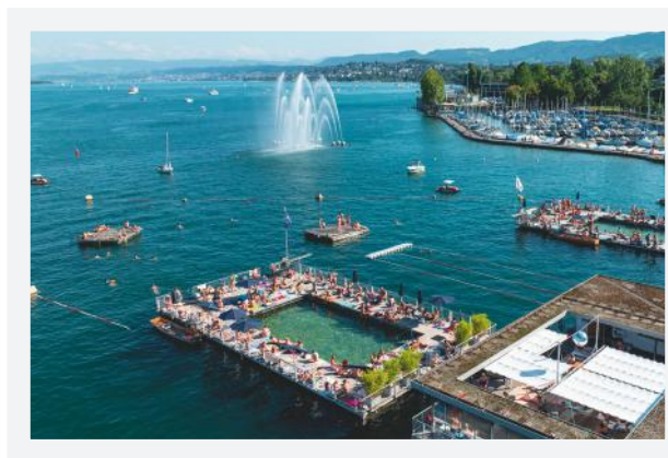
TOP: Unterer Letten, bordering River Limmat ABOVE: Seebad Engle, on the northern edge of Lake Zurich

Osprey Holidays offers a two-night trip to Zurich from £599 per person, based on two adults sharing. The price includes B&B accommodation at the four-star Boutique Hotel Helmhaus Zurich, 15kg luggage allowance and flights from Gatwick on June 16. ospreyholidays.com