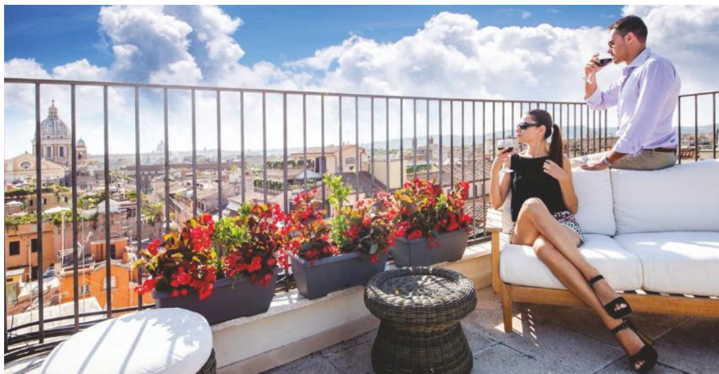
CLOCKWISE FROM LEFT: The Inn at the Spanish Steps, Rome; waterfall near Hotel Rangá, Iceland; proposal at Sydney Opera House; O2 Beach Club & Spa, Barbados